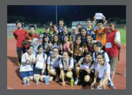
Students mingled and networked with fellow pharmacy undergraduates from different institutions, amid a healthy and active setting.