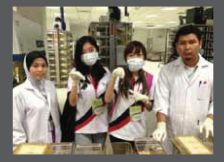
Students gain exposure and insight to the field of pharmacy through the annual event organised by the Malaysian Pharmacy Students Association.