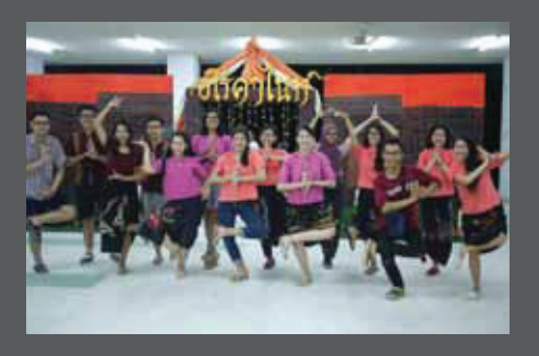
Experiencing different cultures through our student exchange programme with partner universities in Australia, Thailand and India.