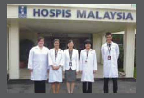
Regular visits to Hospis Malaysia increase awareness of the pharmacist's role in palliative care. Students learn from real-life cases and gain appreciation for medication and symptom management.